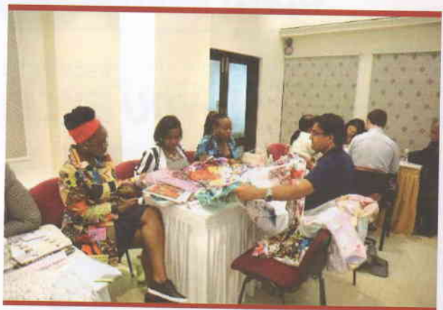
African Delegates from Ethiopia, Kenya, Uganda & Rwanda at the B2B Meetings

Among the activities offered to the betterment of the industry & for enhancing the quality of Education in Textile Engineering, a special Technical session was organized by India ITME