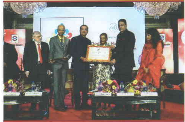
Best Digital Adoption By An Industry Association – Jodhpur Handicrafts Exporters

India ITME Society acknowledged the contributions & expressed gratitude to the Stalwarts of the Industry who mentored growth of India ITME Society over the last 4 decades.