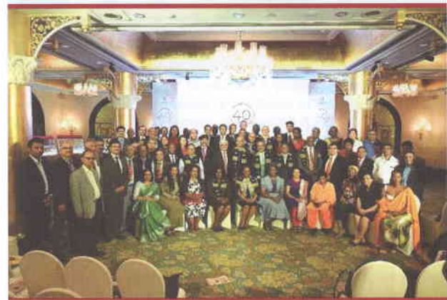
A memorable picture of Speakers & Guests during the 40th Year celebration for India ITME Society

Postal Service", educating audience about the services rendered by the Indian Postal Department even in the toughest of the tough conditions & how India Post plays a part not only in our heritage but also in our day to day lives even in today's digital times.