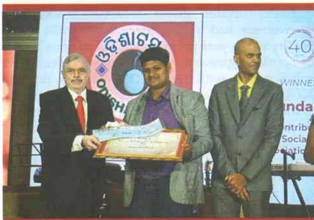
Outstanding Contribution to Industry Growth & Social Impact By An Association – Bhagamunda TRCS Ltd.

India ITME Society extended the mood of celebration for both young & old, across the social & business segments. Certificate of merit & a cash prize of 1500 USD (1 Lakh INR) were awarded to the winners of the contests organized by India ITME Society in various categories.